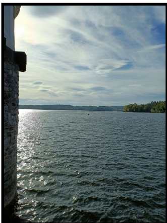
showing the approach taken to bomb the dam and the dam itself (L-R)

At the going down of the sun and in the morning, we Will remember them.