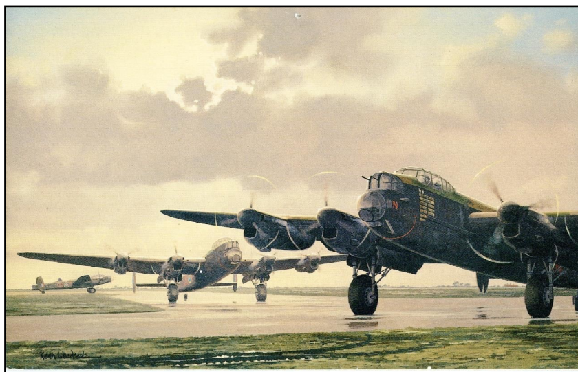
B111 Lancasters of 61 Squadron courtesy of artist Keith Woodcock

Further information & pictures can be found on this link below http://raflincolnshire.blogspot.com/2013/05/hidden-gems-of-housing-es-tate.html