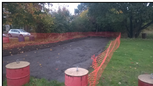
Station main entrance road, Leisure Centre carpark area. (left & right)