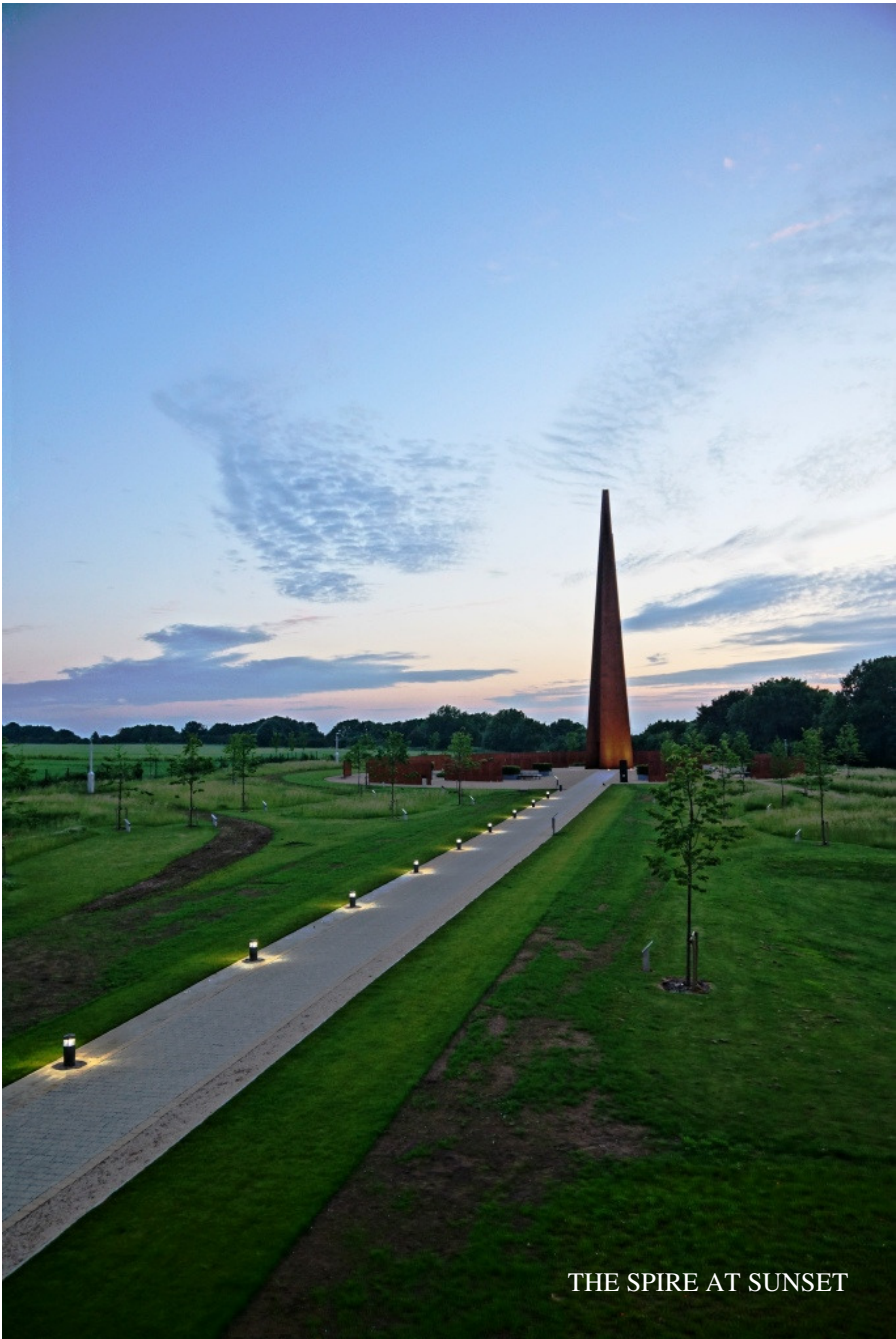
THE SPIRE AT SUNSET