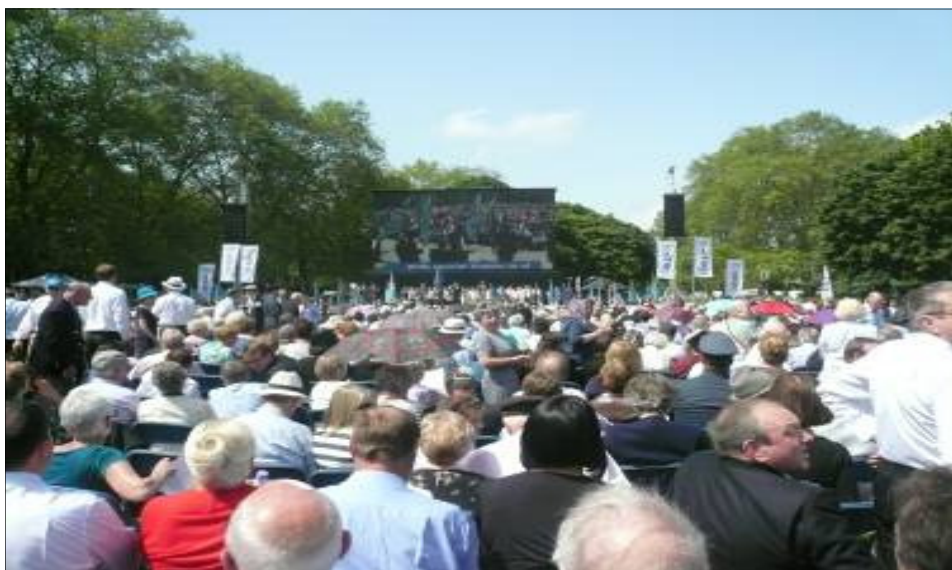
View of the guests in the area with the large screen to witness the events of the day