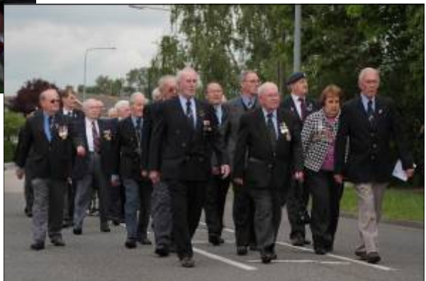
The veterans in the march past.