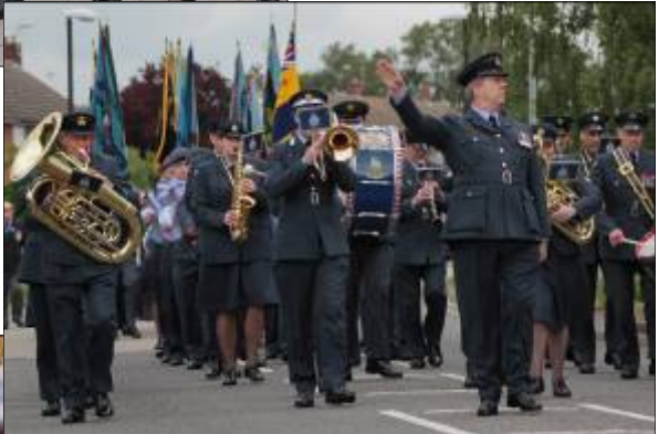
The RAF Waddington Voluntary Band leads the march past