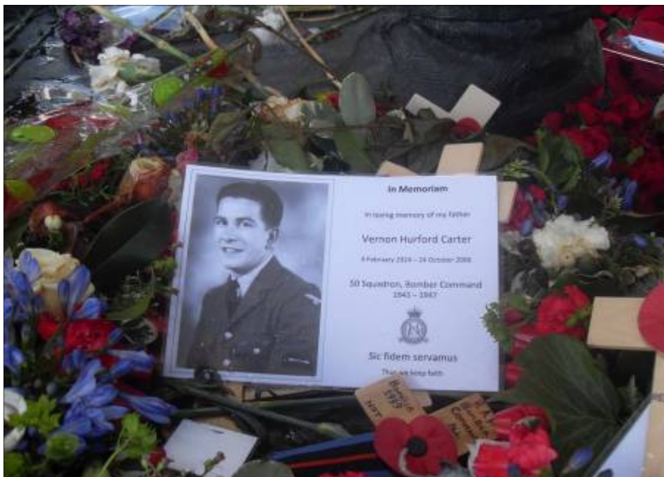
One of the many tributes to former Bomber Command members on the new memorial. This one to a former 50 Sqn member.