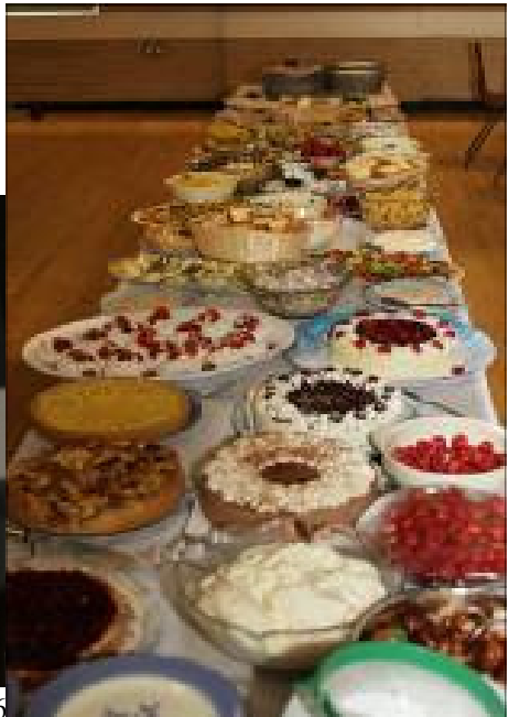
Plenty of food to go around