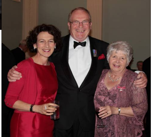
A thorn between two roses